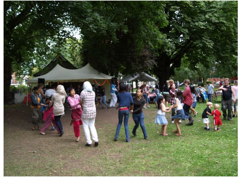
At the Art Block