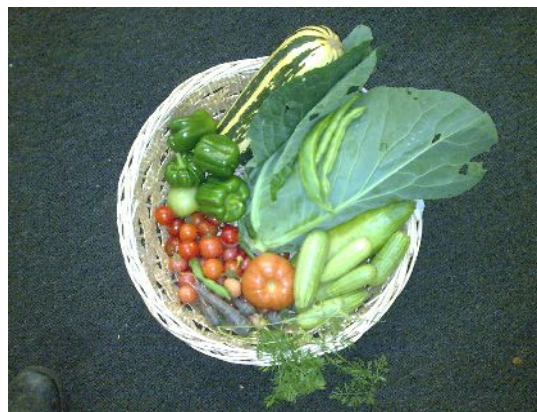
Gardening and Allotment