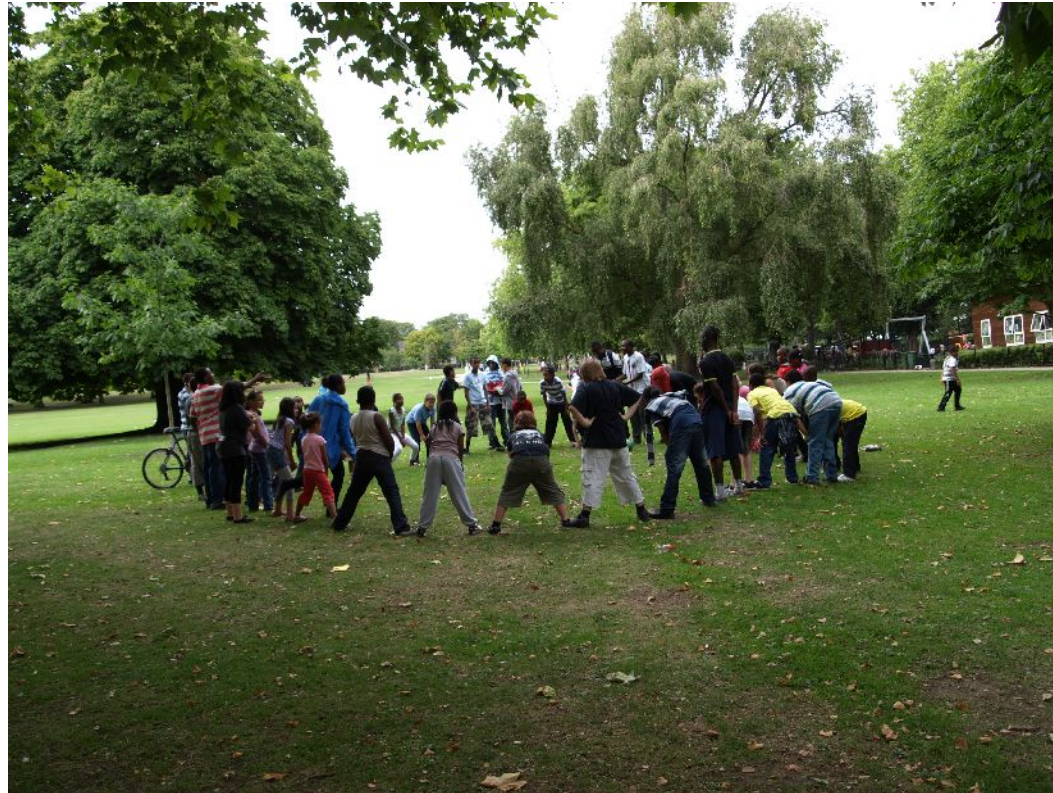
Sport & outdoor play