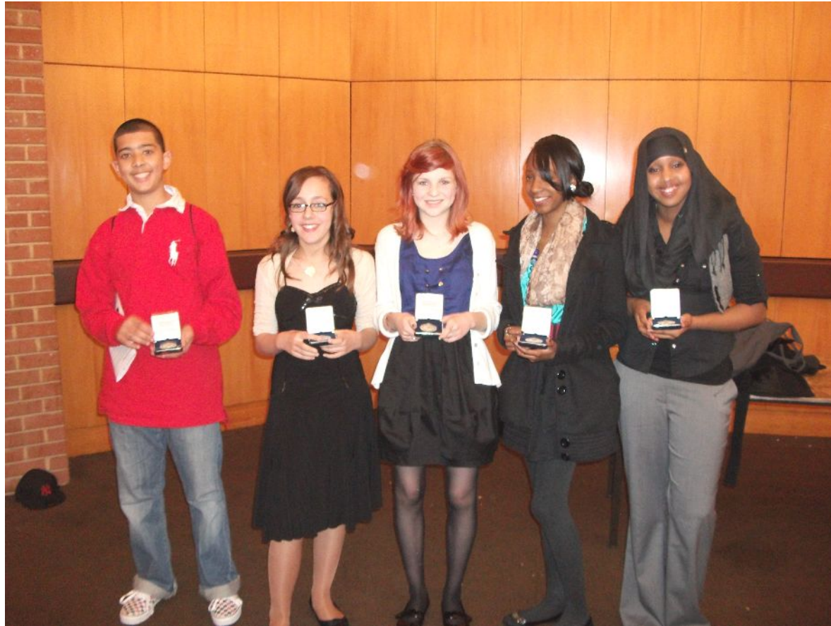
Jack Petchey Award