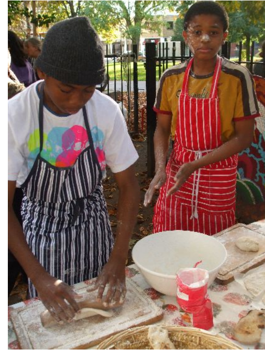
Cooking and Eating